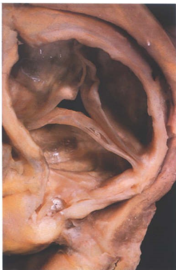
Normal Aortic Valve

Barbara Bush and Robin Williams have brought attention to a heart condition called aortic valve stenosis. The aortic valve controls the flow of blood from the left ventricle of the heart to the aorta, the main artery of the body. The valve becomes narrow, making it harder for the heart to pump blood to the body. Narrowed valves need to be replaced via open-heart surgery. The old valve is removed and replaced with a mechanical or tissue valve (made from a pig or cow). As serious as open-heart surgery sounds, it has become a safe and common procedure with 17,592 aortic valve replacements done in 2007.